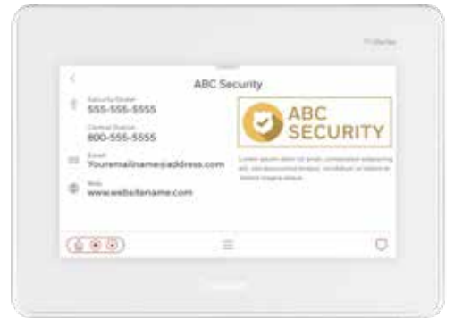
7" AIO Security Panel: PROA7

For installation and service efficiency, radios and batteries are end-user replaceable, and the AlarmNet 360® cloud-based business management tool enables easy remote programming, transmits over-the-air software and firmware updates, performs remote diagnostics and monitors and provides analytics on system usage and activity.